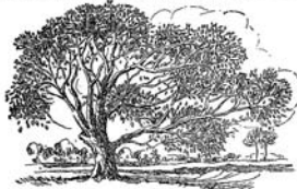
One of the stately oaks that have stood sentry near the Mansion for well nigh two centuries.

Behind you and your investment here stands the University Park Co., Inc. Not real estate speculators, but a body of gentlemen who are deeply impressed with the beauties of this tract and the possibilities of its development into a model suburb of America's Capital City.