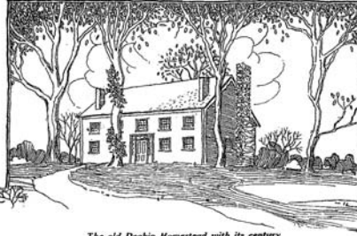
The old Deakin Homestead with its century and a half of traditions.