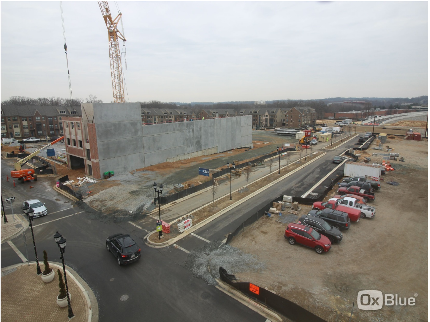
Picture Below: Building 5 Parking Garage Progress – Precast Walls Installation